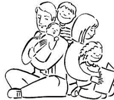
Nursery Volunteer Opportunities