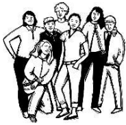
Junior High Students